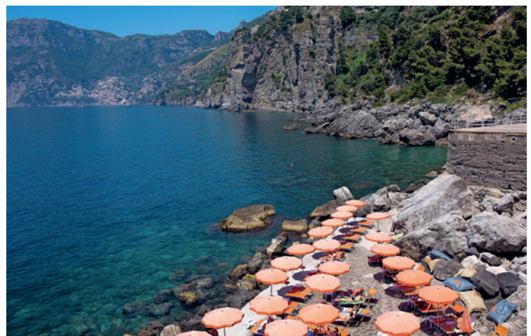
The secluded La Gavitella Beach is a locals' favourite and lively hangout with regular live music in the summer