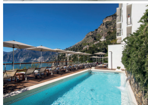
Casa Angelina’s chic, all-white aesthetic provides an oasis of calm amid the bustle of Italy’s hugely fashionable Amalfi Coast