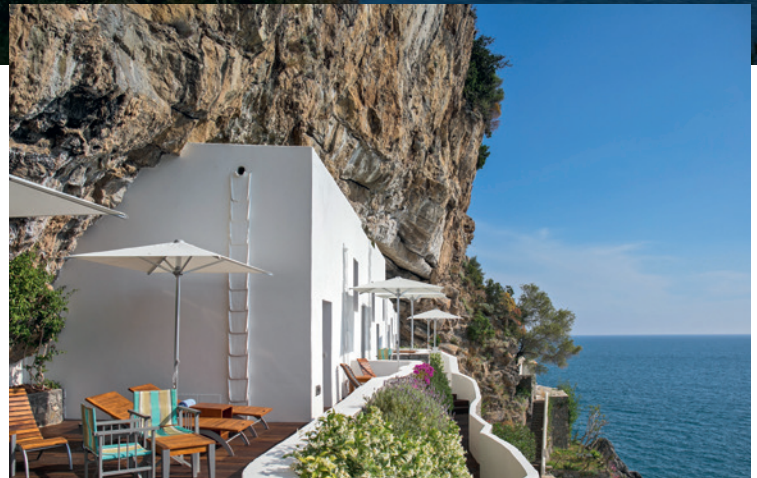
The ultimate romantic getaway: Casa Angelina's newly refurbished fisherman's cottages are set into the cliff right by the shore for a unique experience

spectacular setting offer the perfect backdrop for a generation for whom image curation is a priority, while its intimate atmosphere and discreet service satisfy a growing need for privacy. "The hotel concept came from a hugely personal place but it has struck a contemporary nerve that resonates with