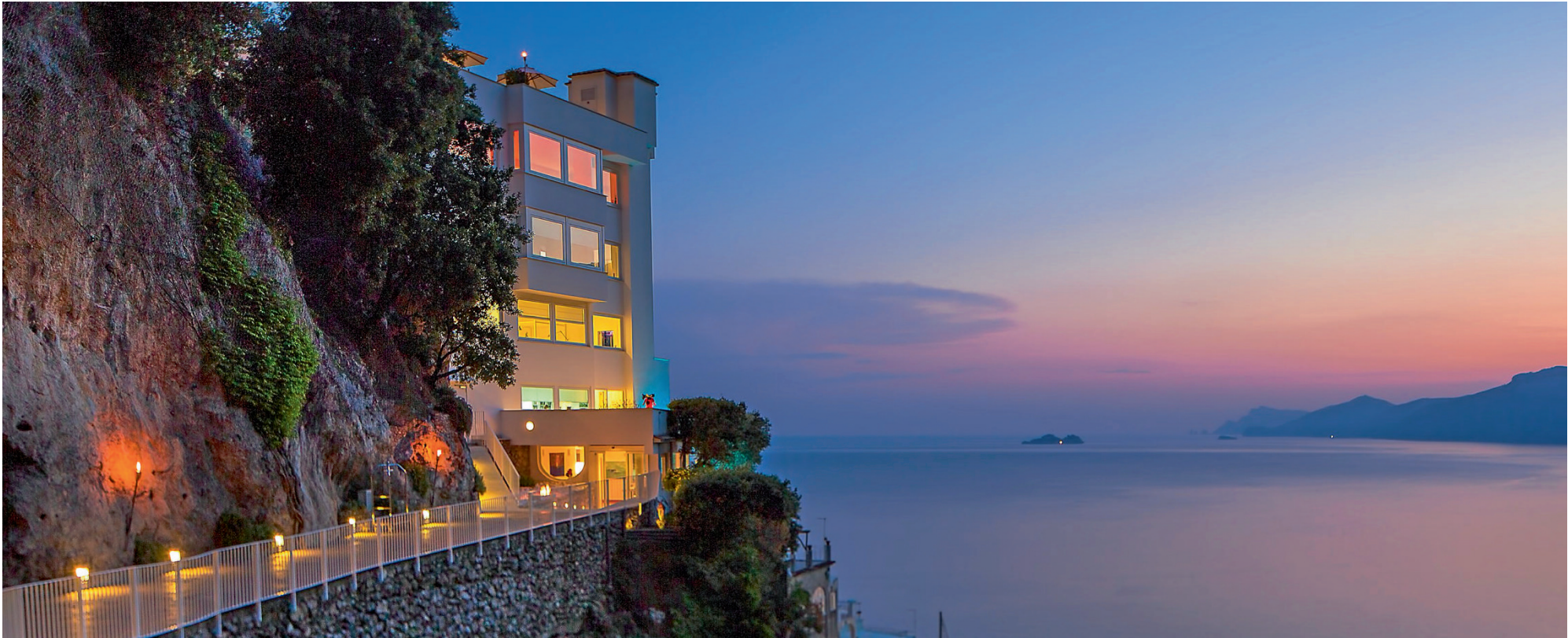
► Casa Angelina, a boutique hotel on the Amalfi coast, offers fine-dining at its restaurant Un Piano Nel Cielo and, below right, the view from the restaurant.