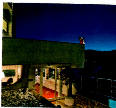
Casa Angelina Hotel

"The sun was setting over the ocean while we were having dinner," says Babey. "The backdrop was beautiful. It was perfect."