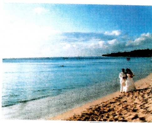
Fairmont Royal Pavilion, Barbados Resort